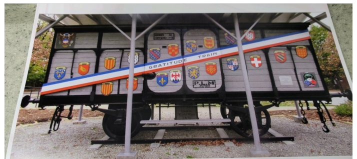
The Missouri Merci Boxcar is located at the Missouri State Fairgrounds in Sedalia, MO. Gifts from Missouri's Merci car are on display in the Pettis County Historical Museum in Sedalia.